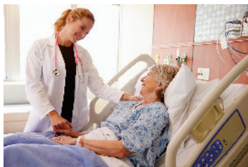
In Patient Department (IPD)

APA Insurance has an extensive cashless clinic & hospital network in Laos, Thailand and in Cambodia. Members won't have to pay any medical bills up to the limits of the policy.